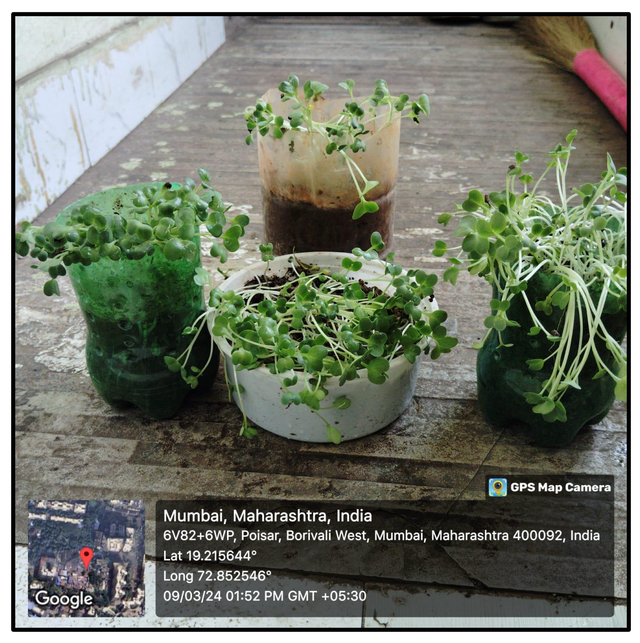
Outcome of Sapling Plantation Drive